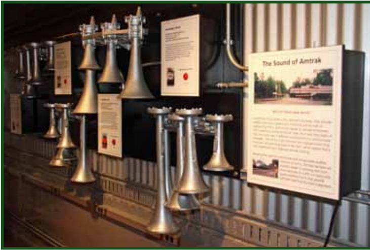
"The Sound of Amtrak" display