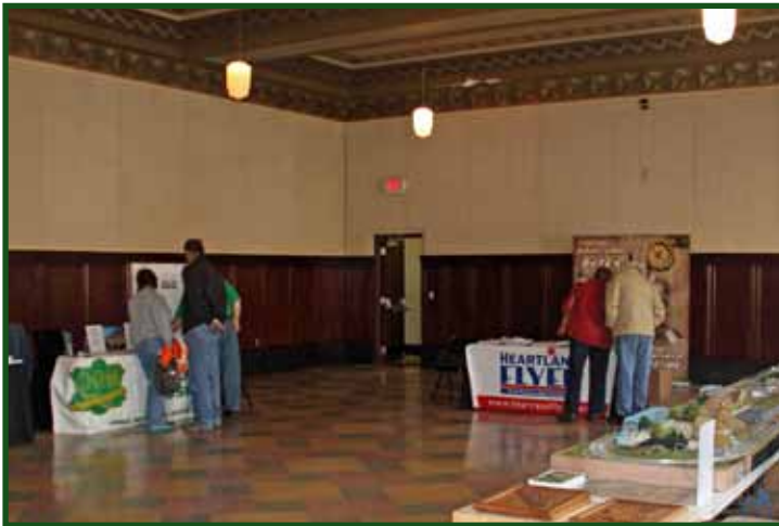
Local organization displays setup in the Depot waiting room. ORM's is at left