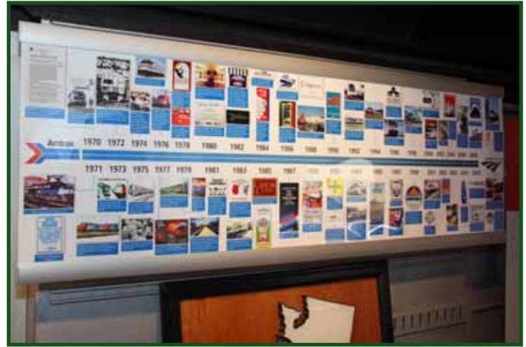
Time table display