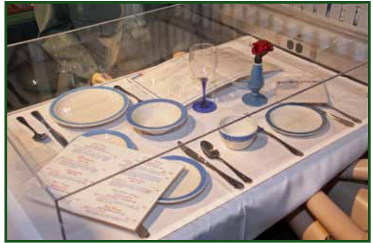
Amtrak dining car place setting