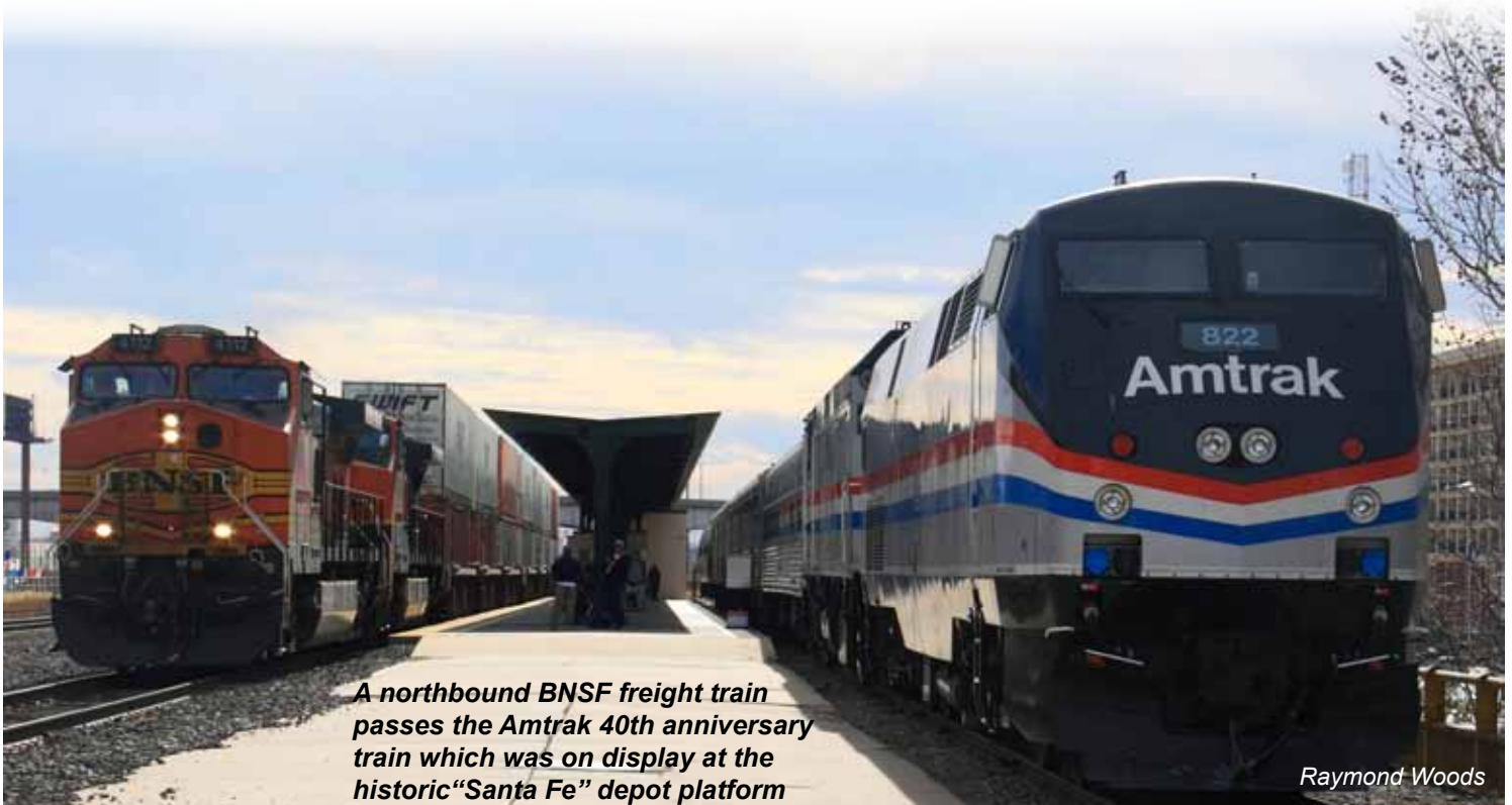
A northbound BNSF freight train passes the Amtrak 40th anniversary train which was on display at the historic "Santa Fe" depot platform