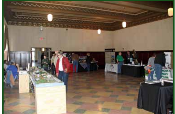
Local organization displays setup in the Depot waiting room.