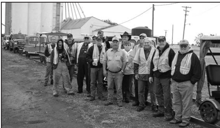
Ride participants at Drummond, Oklahoma