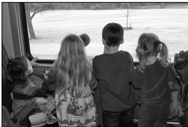
Young riders enjoy the views on the trip through Lincoln Park Golf course.

The 2010 Christmas train rides were a great success making children and adults happy.