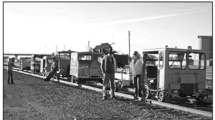
Preparing to turn around at Enid for return trip to Clinton