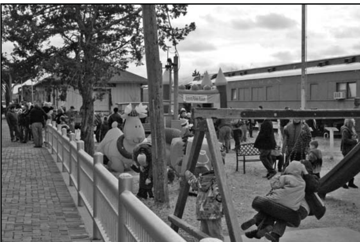
The playground and moon bounce were busy attractions before and after train trips.