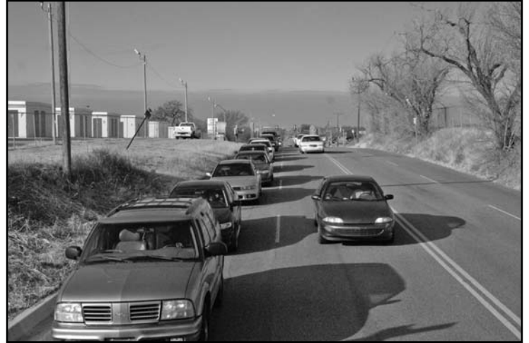
Left lane traffic lined up for free gas