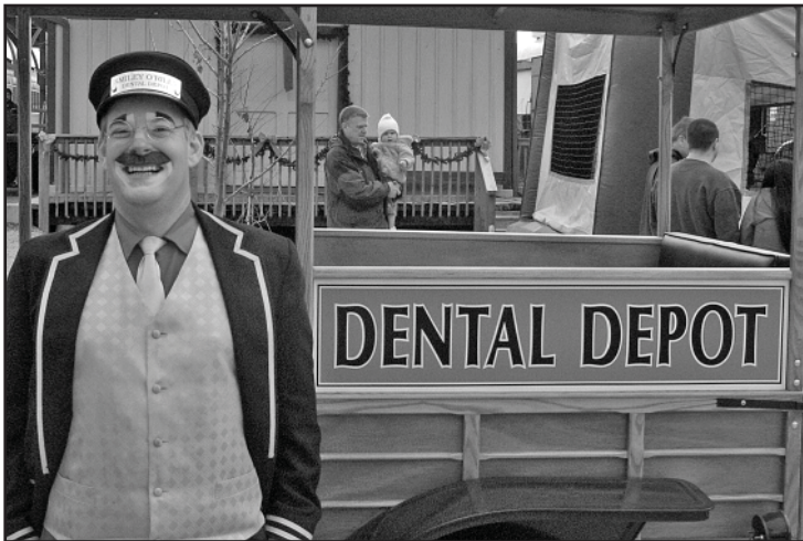
Dental Depot's "Smiley O-Riley" poses with classic truck