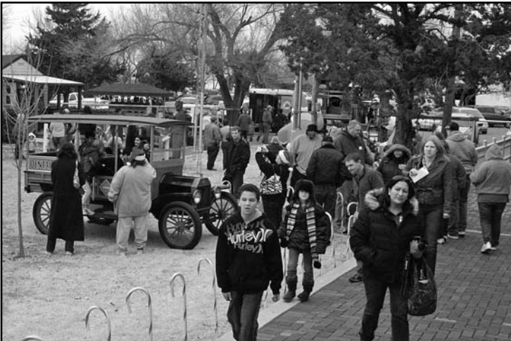
We love crowds of happy folks at the ORM