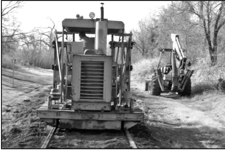
Tamper working south of 16th St near Echroat station sign

December 31st track maintenance south of 16th Street.