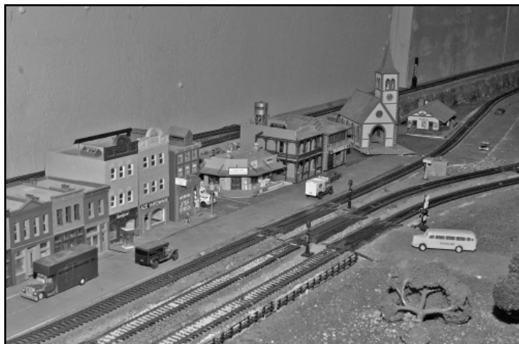
Street scene on the ORM model railroad