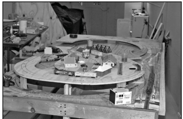
Donated layout that will be added to the existing model railroad