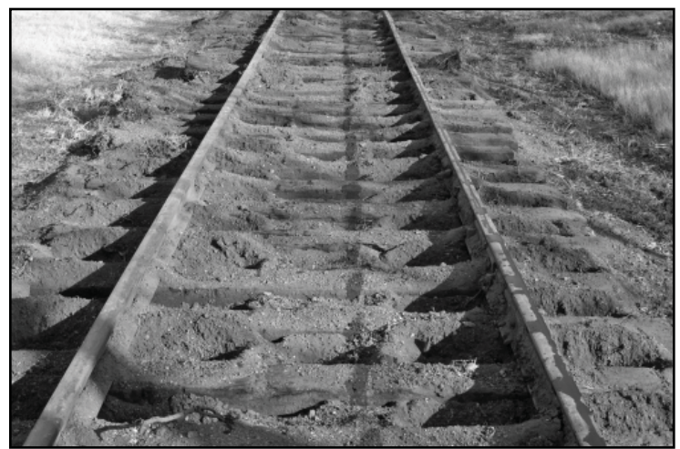
View of the track after the tamper has passed. The next stage will be to operate the regulator to fill holes and shape roadbed