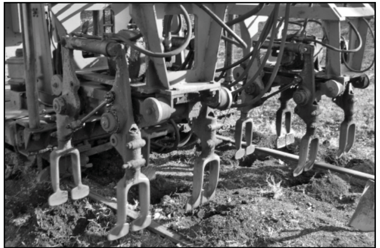
Tamper compaction teeth. Vibration is also applied