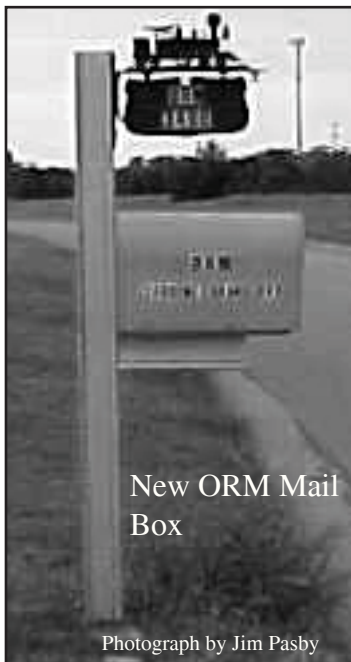
New ORM Mail Box